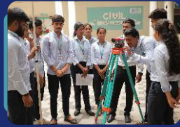
Hands on Sessions