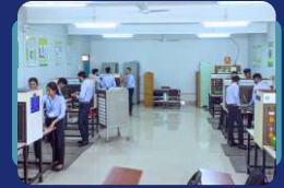
Well Equipped Labs