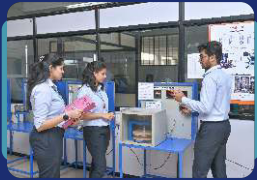
Learning at Incubation Centre