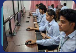
Training in Green Skill & AI